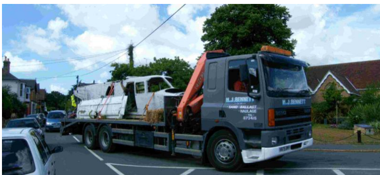
On 17 July 2010 "Charlie November" was transported from the B-N site at Bembridge Airport for a new home in the East Wight

In recognition of the historic significance of Islander G-AVCN a working group was formed in May 2009 to see how best to re-start the project. It was decided that a new location should be found as the first priority. At one stage it was thought that a mainland facility could be a possibility but with the help of Bembridge Heritage Society a place was found in the East Wight.