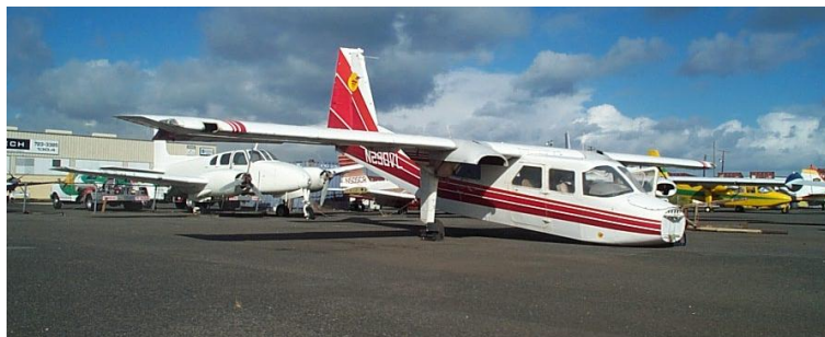
G-AVCN, usually referred to as "Charlie November", in a derelict state at Isla Grande Airport Puerto Rico, 1999

The restoration project began when Airstream International Group sponsored the dismantling and shipping of the aircraft from Puerto Rico in early 2000 as part of an ambitious plan to restore it to flying condition. Wightlink provided sponsorship for the final leg of the journey across the Solent to complete G-AVCN's return to its Isle of Wight home.