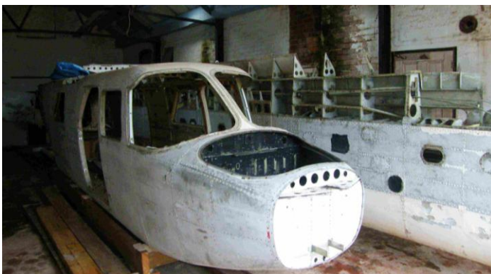
Charlie November's fuselage and wing under cover in the East Wight Workshop November 2010

Following the successful move in July of "Charlie November" from the B-N Works to the new East Wight workshop, work has progressed at a steady pace to construct new wing stands and a more substantial fuselage cradle. Meanwhile building work has been underway to adapt the workshop building with an enlarged access door, new electrics and lighting. Further work is continuing to seal the floor, paint the wall and roof trusses and round up work benches and cupboards to enable restoration work to proceed in an efficient and safe manner.