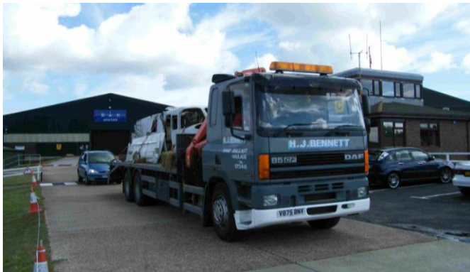
"Charlie November" Departs the B-N Works on 17 July 2010

Following the successful move in July of "Charlie November" from the B-N Works to the new East Wight workshop, work has progressed at a steady pace to construct new wing stands and a more substantial fuselage cradle. Meanwhile building work has been underway to adapt the workshop building with an enlarged access door, new electrics and lighting. Further work is continuing to seal the floor, paint the wall and roof trusses and round up work benches and cupboards to enable restoration work to proceed in an efficient and safe manner.